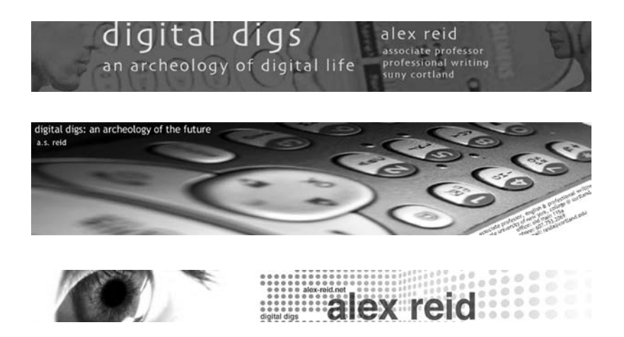
Figs. 2–6. Examples of different banners I have used for my blog.

used dark text on a light background. You should experiment with font, font size, and spacing. Because my posts tend to be long, I have emphasized readability by selecting a simple font and adding some additional spacing between the lines (i.e., more than single-spaced).