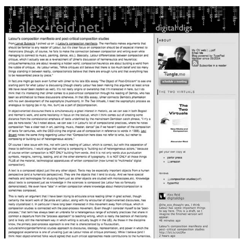
Fig. 1. A screen capture of my current blog, www.alex-reid.net.