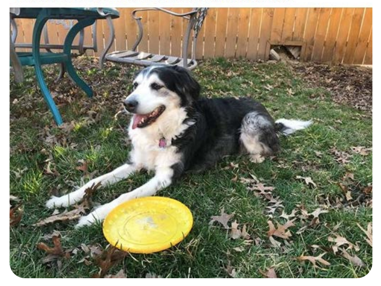
Figure 1. Photo of my dog taken from my Facebook page that represents the visual mode.

A beautiful evening to cook out and play with my dog! So happy the semester has come to a close and I can celebrate it like this!