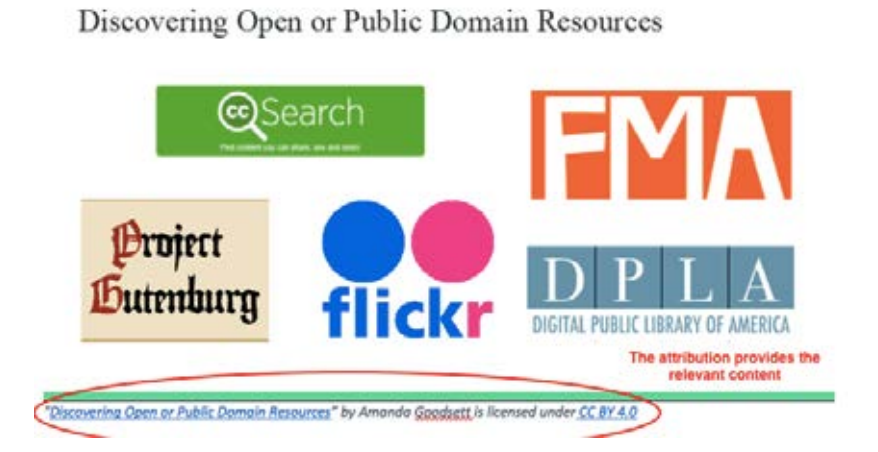
Figure 9. An example of an ideal attribution, which includes a hyperlinked title for the image, a clear author name, and license information that is also hyperlinked. (Image was created by the author using "Creative Commons Licensing" by Mandi Goodsett licensed under CC BY 4.0)

Figure 8. An example of an inappropriate attribution that lacks title, clear author, source link, and license. (Image was created by the author using "Creative Commons Licensing" by Mandi Goodsett licensed under CC BY 4.0)