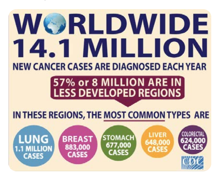
Figure 3. Infographic emphasizing the spatial mode. The infographic uses different sizes of text and different shapes to emphasize statistics surrounding cancer diagnoses and common types.

The gestural mode refers to gesture and movement. This mode is often apparent in delivery of speeches in the way(s) that speakers move their hands and fix their facial features and in other texts that capture movement such as videos, movies, and television. Figure 4 shows Michelle Obama's gestures at a speech she gave in London.