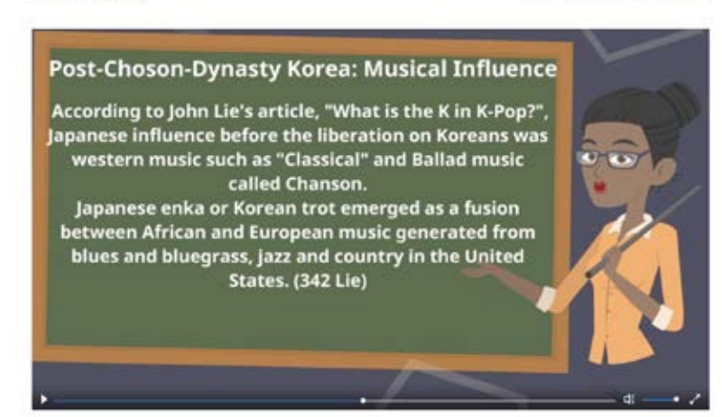
Figure 6. A screen shot of a student's video that illustrates her use of scholarly content. Video shows an animation of a teacher standing at a chalkboard. On the chalkboard, there is text explaining the musical influences on Post-Choson-Dynasty Korea. (Permission to use this image was obtained from the student).