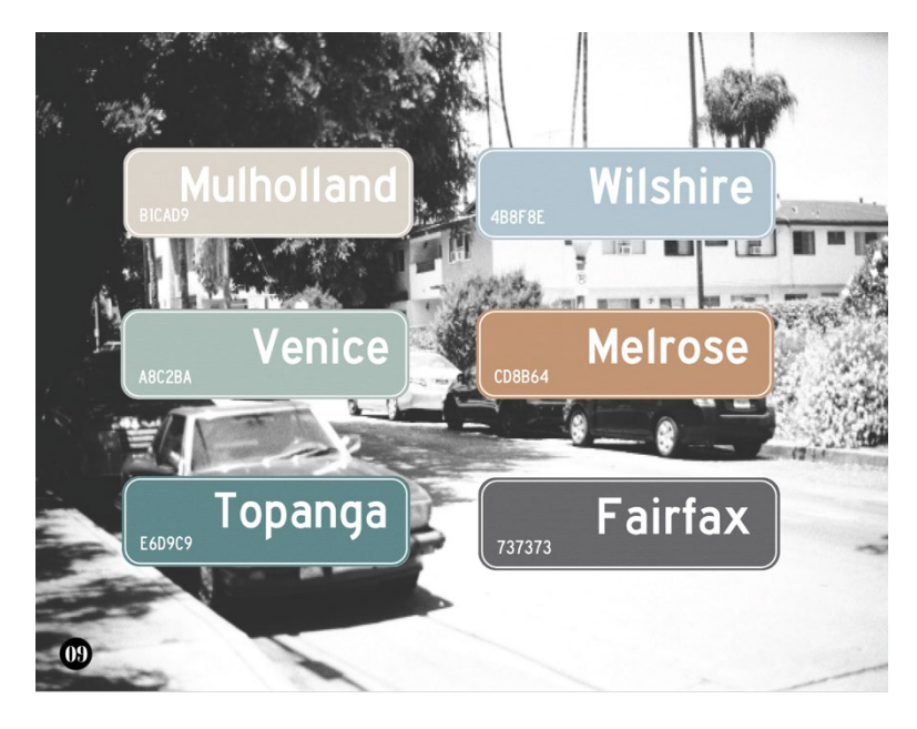
Figure 1: Color illustration. Credit Sara Bredice.