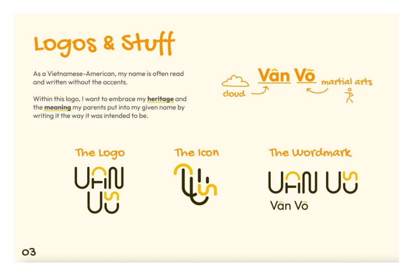
Figure 3: Logo. Credit Vân Võ.