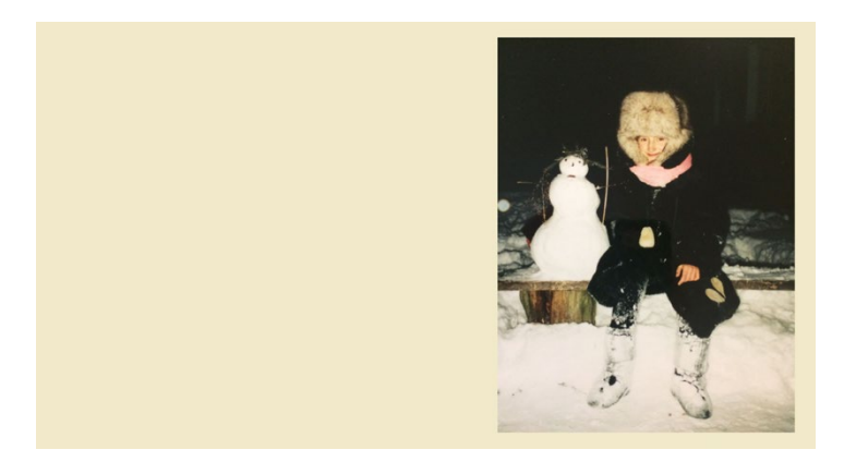
Fig. 1. The author as a young child sitting in snow with a snowman.

• Repeat this step with another photo/image so that students can remember the steps better (see fig. 2).