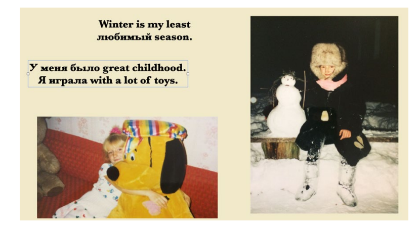
Fig. 4. On the left: the author as a young child hugging a big toy. On the right: the author as a young child sitting in snow with a snowman.