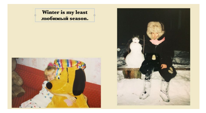
Fig. 3. On the left: the author as a young child hugging a big toy. On the right: the author as a young child sitting in snow with a snowman.

• The next step is inserting text. To do that click on insert → text. Please remember to share your screen with the participants. Once the box for text appears, explain to students that they can write as their thoughts flow, using various languages they know or have been exposed to (see fig. 3). Tell them if the word in another language comes first, they can write it in that language. In case this workshop is taught in a monolingual classroom, remind students of some dialects they might speak or words they know in other languages, even some animal language sounds which can be connected to their story.