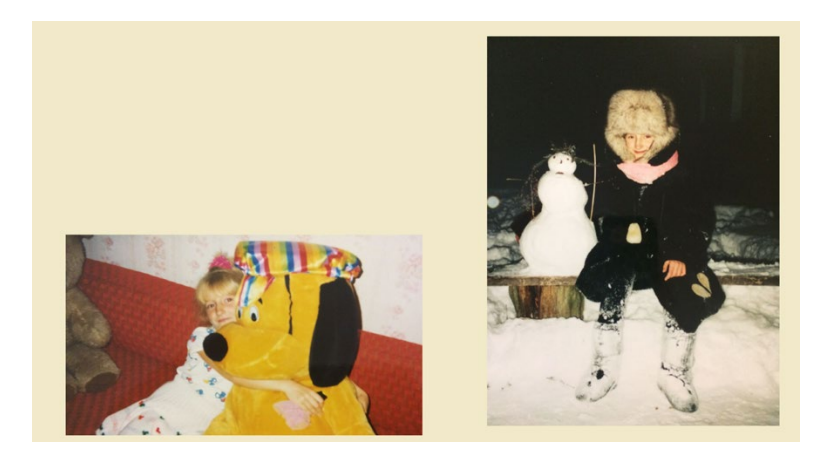
Fig. 2. On the left: the author as a young child hugging a big toy. On the right: the author as a young child sitting in snow with a snowman.

• Repeat this step with another photo/image so that students can remember the steps better (see fig. 2).